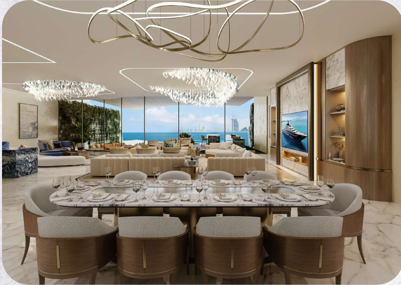
Living room with panoramic sea views